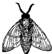
Figure 2: A sample black and white graphic (.eps format) that has been resized with the epsfig command.

spans two columns. To do this, and still to ensure proper “floating” placement of tables, use the environment figure* to enclose the figure and its caption.